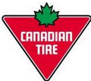
South Lethbridge Store

Big Brothers Big Sisters of Lethbridge & District would like to thank our 6th Annual Big Auction partners, Canadian Tire Southside and Neu-Lite Electric Inc., and all participants, volunteers and donors for their generous and valued support in making the 2011 Big Auction our most successful year yet.